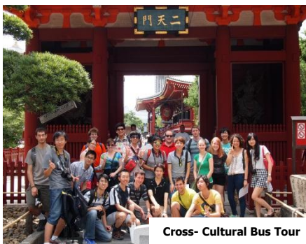
Cross- Cultural Bus Tour