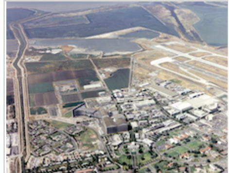
An aerial view of NASA's Ames Research Center.

Ames researchers collaborate with the Federal Aviation Administration to conduct research in air traffic management in order to make safer, cheaper and more efficient air travel a reality. Ames engages in information and education outreach, forms innovative collaborative partnerships, and fosters commercial application of NASA technologies. Ames operates the NASA Research Park , an integrated, dynamic research and education community